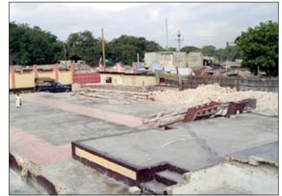
A concrete pad is all that remains of the Haiti Ministries church in Port-au-Prince.