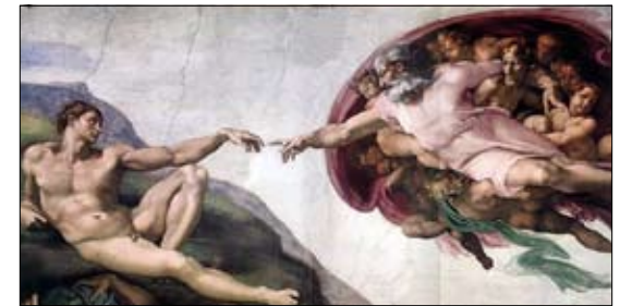
The "God Creates Adam" panel from the Sistine Chapel Ceiling, by Michelangelo

Thanks to AT&T all of us recognize Michelangelo's magnificent image of the hand of God reaching out to touch the hand of Adam to bring him to life, which is the center panel of the ceiling of the Sistine