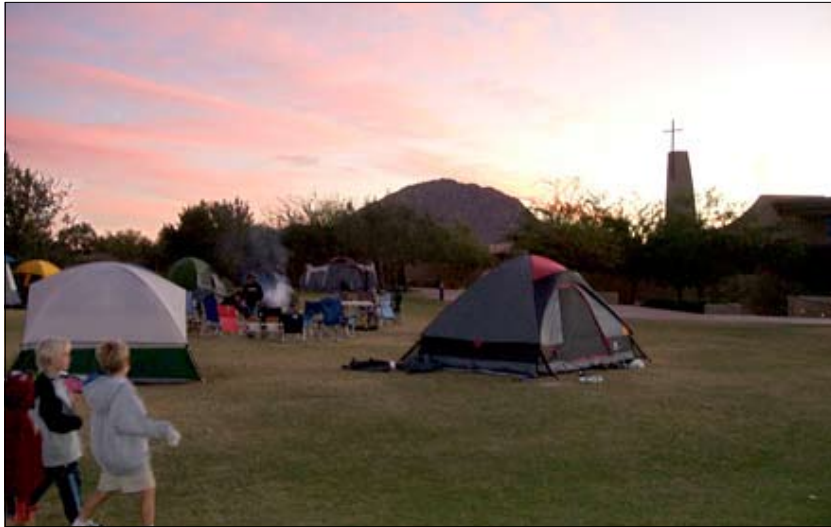
Sunrise on the PPC campus following a Camping on the Green.

Shoebox Ministry is a non-profit service organization with an ongoing program for the collection and distribution of personal hygiene kits to the homeless and working poor in the greater Phoenix area. To learn more about Shoebox Ministry, visit shoeboxministry.org .