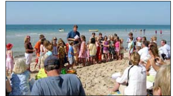
The Sunday morning worship service on the beach at last year's Take Mama to Mexico retreat

to reserve your room today at the Sonoran Sea. A 10-percent discount is guaranteed for all reservations. If five or more rooms are reserved, everyone will receive a 15-percent discount. A 20-percent discount is