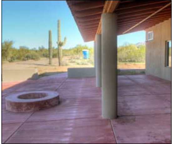
The Youth Building's patio over looks the desert.

Don't miss this opportunity to thank God for our new facilities.