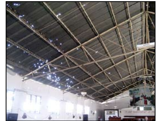
Harmony Church #1 in Port au Prince has holes in its sanctuary roof from gunfire between U.N. soldiers and gangs from 2006. No one was in the church at the time of the fighting.