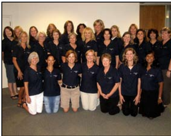
Pinnacle Preschool staff and teachers

Pinnacle Presbyterian Preschool is one of the first early childhood programs to earn accreditation from the National Association for the Education of Young Children (NAEYC), the nation's leading organization of early childhood professionals.