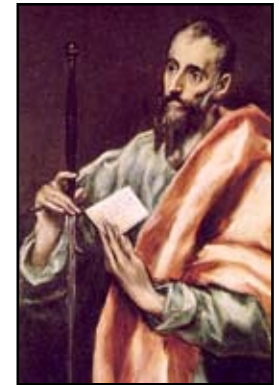
The apostle Paul, by El Greco

This book study will be a perfect complement to the type of reflec-