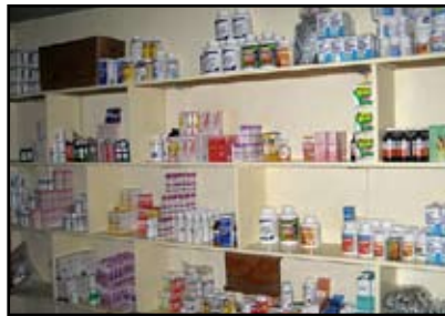
Many of the supplies in the clinic at Harmony Church #1 in Port au Prince were provided by our members.

Our team included two doctors, two nurse practitioners and a medical student who, along with the rest of our team, conducted medical screenings and dispensed non-prescription drugs (some provided by our